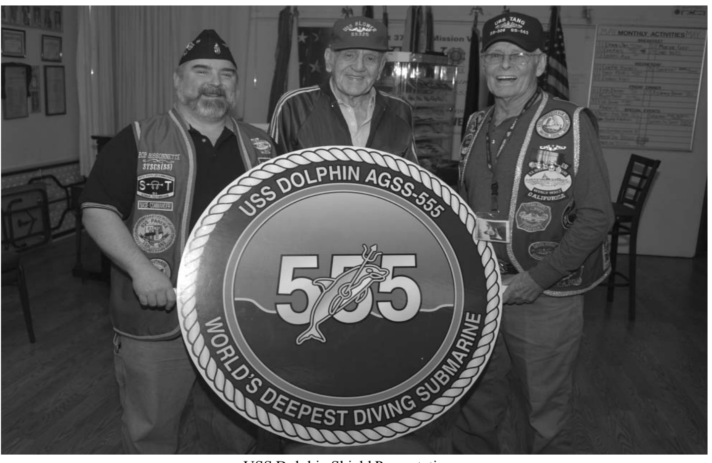
USS Dolphin Shield Presentation