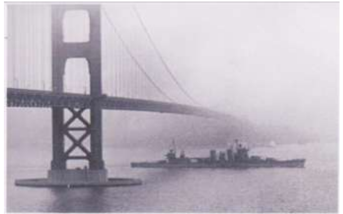
The USS San Francisco sails under what else the Golden Gate Bridge in 1942

My interest in Sutro's and the area was renewed and I broke out my 1967 copy of a map of San Francisco and while looking it over saw an area marked USS San Francisco Memorial. Wondering what the ship was I went on line and read up. The ship CA-38 was a cruiser of the New Orleans class that primarily served during WW 2 in the battle for Guadalcanal in 1942. The next words describe that journey into hell pretty fully.....during the battle the ship was heavily damaged.....her captain and admiral killed.....earlier she mistakenly opened fire on the light cruiser Atlanta causing serious damage and inflicting numerous casualties. Well the ship built in 1934 earned 17 battle stars and other awards and she was decommissioned in 1945 at the