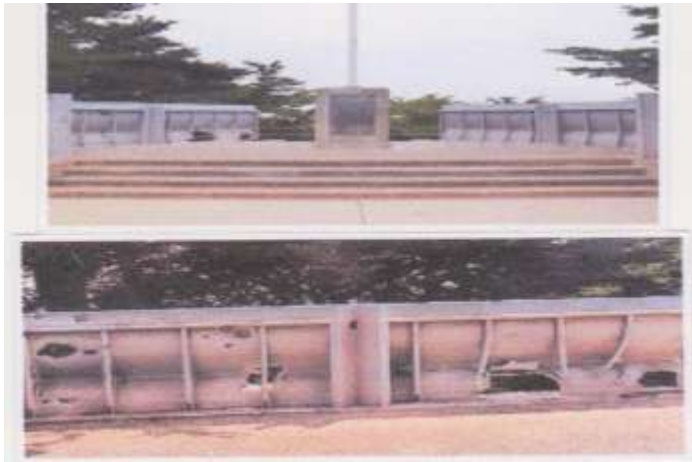
Two shots of the memorial. Note the shell damage in lower photo.

end of the war and scrapped finally in 1959. The memorial features the battle damaged bridge wings from the ship.