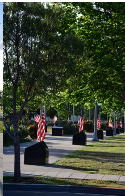
Laying of the Wreath on Memorial Day 2019 at 52 Boat Memorial - Liberty Station San Diego