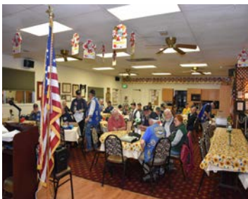
A Motley Crew at the April Meeting.

Lost between June 26 & July 4th 1943 with the loss of 78 men. Runner was on her 3rd war patrol probably due to a mine. Prior to her loss, she reported sinking a freighter and a passenger-cargoman off the Kuriles. This boat's last known ship sunk happened on June 26th, so she probably hit that mine on or after that date but before July 4th, when she was scheduled back at Midway.