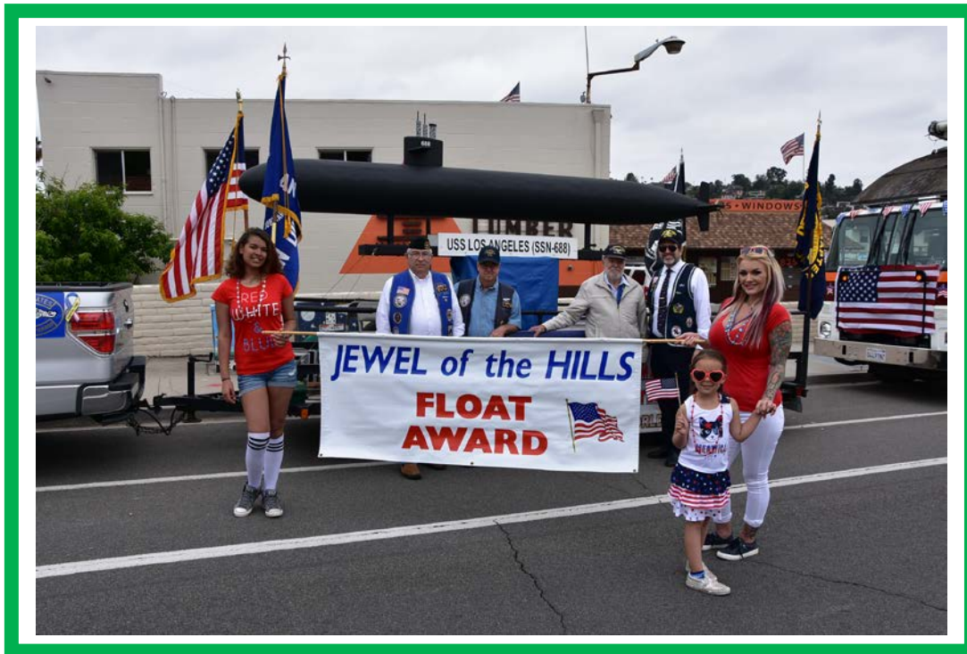
Judged #1 Float at La Mesa Flag Day Parade