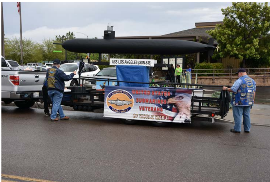
Preparing the Float for the Ramona Main Street Parade

USSVI c/o VFW Post 3787 4370 Twain Ave, San Diego, CA 92120-3404