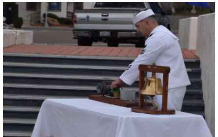
Tolling of the Boats Ceremony