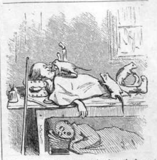
Where he receives every attention from the former occupants of the Apartment.