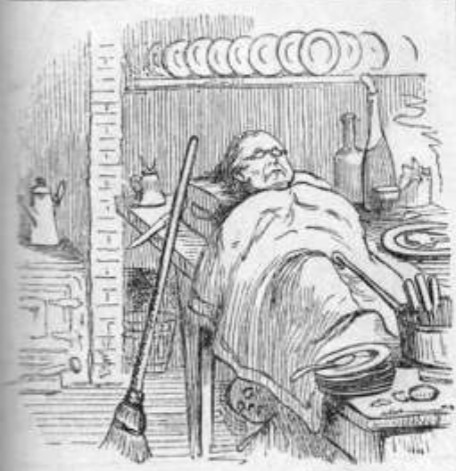
The "Gentlemanly Clerk" gives him his choice of the Roof or the Kitchen.—He prefers the latter.