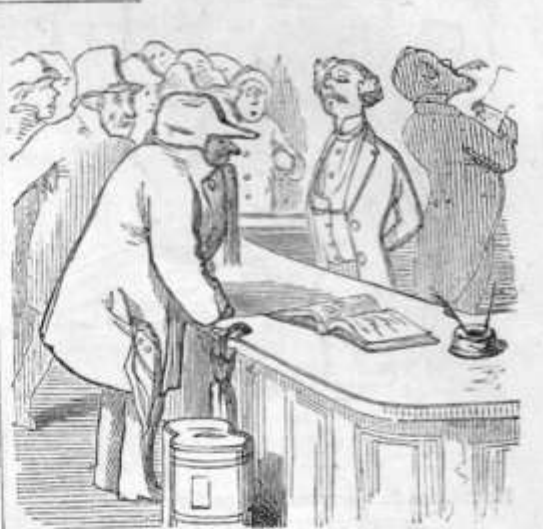
Having reached Washington, he goes to the Hotel and asks for "A Nice Room, not too high up."