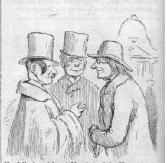
He falls in with a "Member of the House," who introduces him to a "Senater."