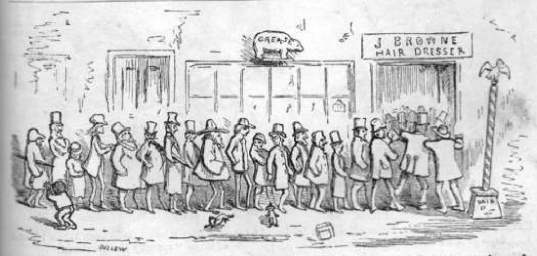
In the morning he proceeds to the Barber's Shop for a "Wash and a Shave." He waits two hours for "his turn"—which does not come.