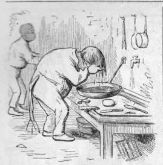
He returns to his room, and performs his ablutions as well as circumstances admit,