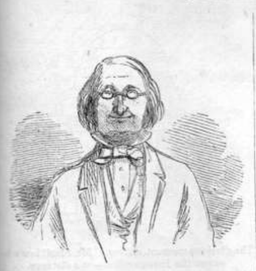
Mr. Shadblow, having voted for the successful candidate, resolves to be at the Inauguration .